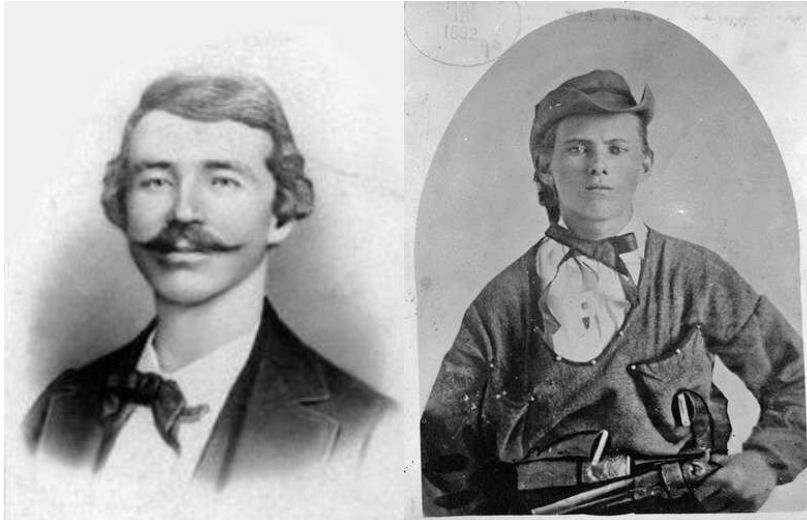
William Quantrill and a young Jesse James